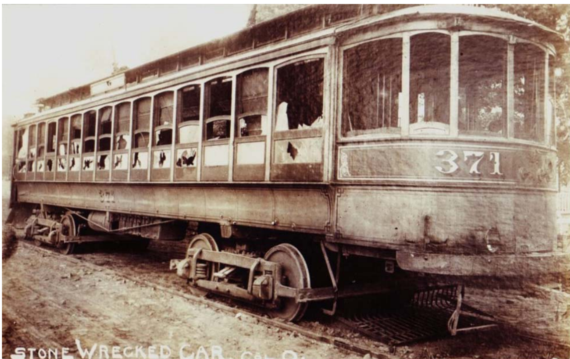
The Westerville car derailed and stoned by a mob.